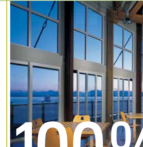
Puget Sound, Washington

100% amount of manufacturing scrap that is recyclable