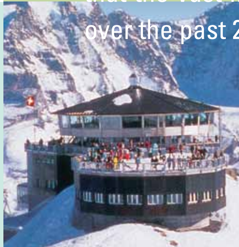
Piz Gloria ski lodge on Schilthorn mountain in the Swiss Alps

Vinyl windows are so durable that the vast majority of them installed over the past 25 years are still in use